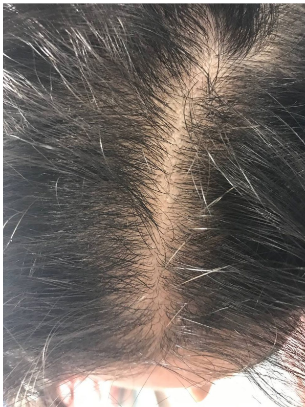
Fig. 3 Twenty-eight-year-old female with acute telogen effluvium (diffuse) and hair pull test around 25%

literature, the association of ATE with dengue fever, influenza, human immunodeficiency virus infection, typhoid fever, scarlet fever, pneumonia, tuberculosis, pertussis, and malaria have already been recorded [9, 10].