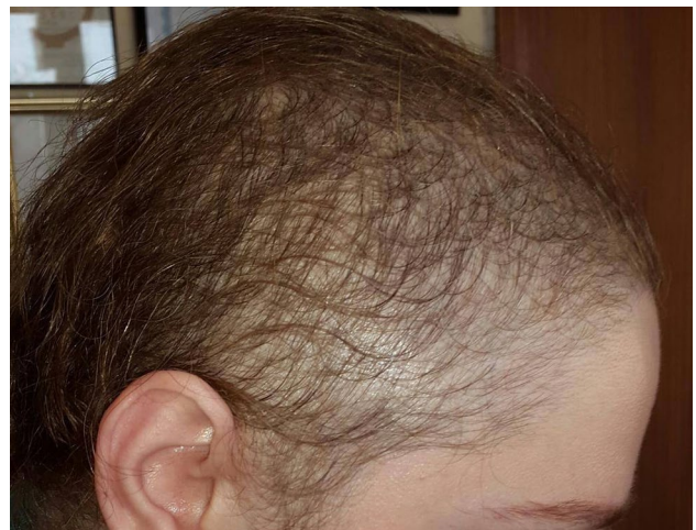
Fig. 1 Thirty-two-year-old female patient with severe acute telogen effluvium (diffuse) where the hair pull test is > 40\%

TE usually occurs 2 to 3 months following trigger events, including severe infective episodes [4]. In published